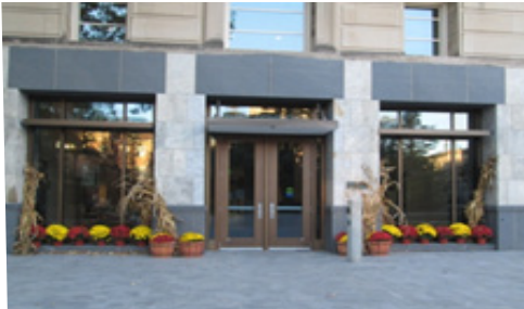
Left photo: East Entry to Curtiss Hall

Agricultural Hall, built between 1906-1909 for $340,000 was renamed Curtiss Hall in 1947. It has been a tired looking building for years but thanks to over 700 donors Curtiss Hall has been renovated to be a very attractive, functional building for our students. The exterior of Curtiss Hall remains the stately building you remember. However, all new windows (64 to be exact) have been installed throughout the building and a majestic entry greets students as they approach the building from the east. Remember those steep stairs just inside the east entrance? They are gone and in its place is the Harl Commons. The photos below show what a difference the renovation made to this area of the building.